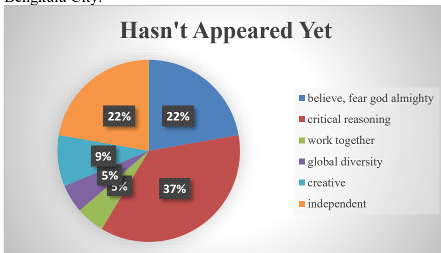
Diagram 2. Data from research results that have not yet appeared at Kindergarten It Al-Kiswah, Bengkulu City.

Based on the results of the diagram, the most dominant character dimensions appearing in Al-Kiswah IT Kindergarten children are mutual cooperation and global diversity (21%), followed by creativity (19%), and faith, devotion to God Almighty, and independence (15% each). Meanwhile, the critical reasoning dimension has the lowest percentage of occurrence (12%). Even though most of the character dimensions have begun to develop, strengthening critical reasoning abilities still needs to be optimized, considering that the highest percentage has not yet emerged (37%). Apart from that, the characters of faith, piety and independence have not yet emerged at 22%, creativity at 9%, and mutual cooperation and global diversity at 5% each. This data emphasizes the need for more varied learning strategies to foster critical thinking skills so that they are balanced with other character dimensions.