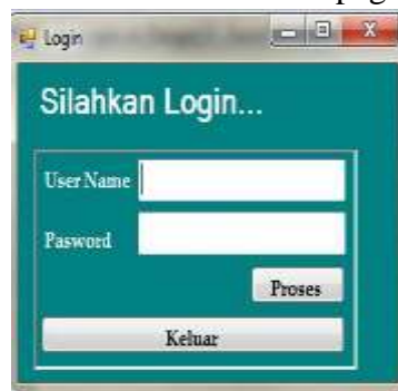
Figure 4. Home & login

The result is an information system that has 5 tables, 11 forms and 3 output interfaces. The main page interface in Figure 4,