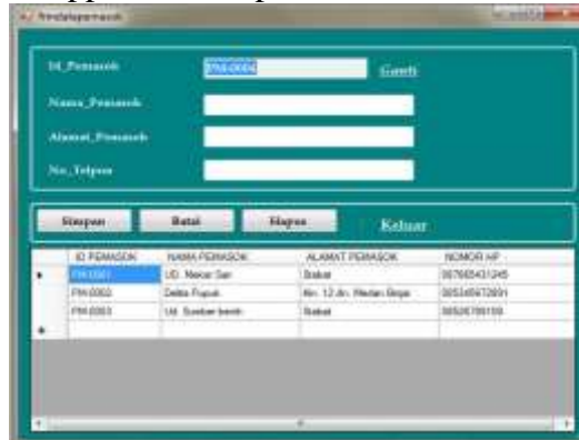
Figure 6. Supplier Data Input Form

The supplier data input interface can be seen in Figure 6 below.