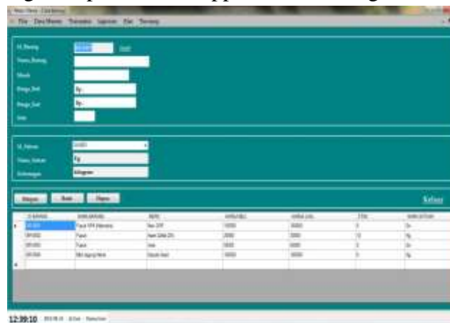
Figure 5. Goods Data Input Form

Figure 5 presents the appearance of the goods data input form.