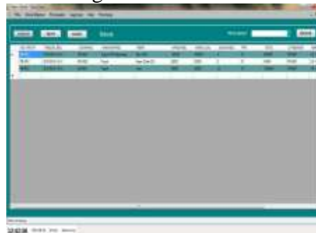
Figure 7. Purchase Transaction Data View Form

The following shows the interface for the purchase transaction.