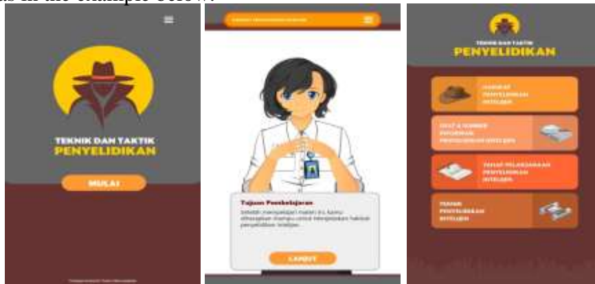
Figure 2. Example of Product Display

From the series of processes, a number of changes were obtained for the product being developed, such as: material aspects, design aspects, curriculum aspects, and program aspects; as in the example below.