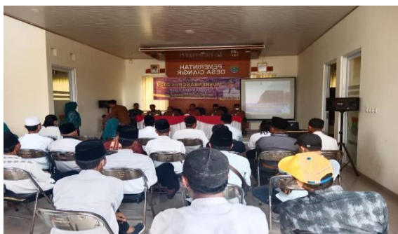
Figure 2. Ciangir Village Musrenbang

In terms of the application of the Village Financial System (Siskeudes), the Ciangir Village government as the implementing organization and the Ciangir Village community as the beneficiary group have seen compatibility. As in the village development plan deliberation (Musrenbang) and village development, the village community participates in its implementation so that it can lead to positive social interactions and initiate the principle of transparency from the village government.