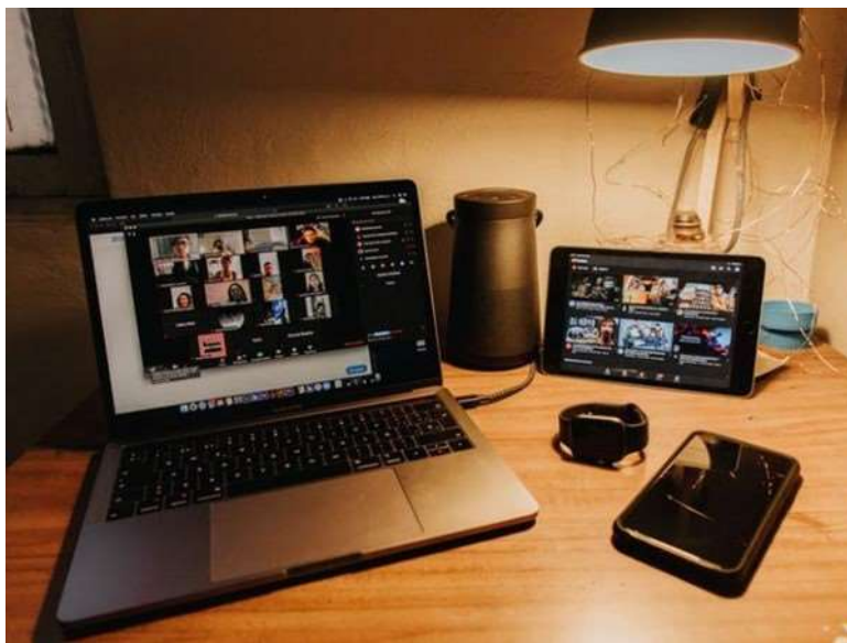
Figure 6. All ICT Devices support for Zoom application

It is the reason Zoom is one of the supporting applications for ICT in online learning that, in addition to easy access, the Zoom Meeting application can be run on various devices, including Android phones, iPhones, computers, or even laptops (Figure 6).