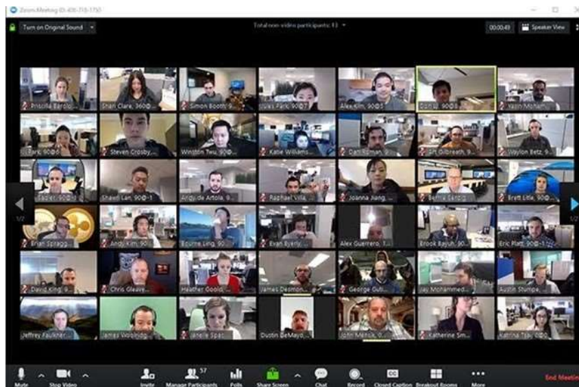
Figure 1. Learning Methods with Online Applications

Application of e-learning as an integral part of the entire learning process and method Higher education, especially in Indonesia, has increased rapidly in the last decade. It is supported by the development of technology and the community's skills to utilize technology. Rahayu (2020). Moreover, amid a pandemic that is currently hitting all countries globally, the concept of online learning by utilizing ICT (information and communication technology) (Figure 1). Different in each institution. Several schools, including international standard pilot schools (RSBI), have equipped themselves with ICT facilities to support the teaching and learning process. Application of e-learning as an integral part of the entire learning process and method Higher education, especially in Indonesia, has increased rapidly in the last decade. It is supported by the development of technology and the community's skills to utilize technology. Rahayu (2020). Moreover, amid a pandemic that is currently hitting all countries globally, the concept of online learning by utilizing ICT (information and communication technology) (Figure 1). Different in each institution. Several schools, including international standard schools, have equipped themselves with ICT facilities to support the teaching and learning process. It has become a necessity.