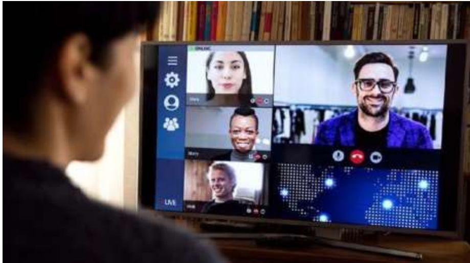
Figure 5. High Access Quality Available on a wide variety of devices

It is the reason Zoom is one of the supporting applications for ICT in online learning that, in addition to easy access, the Zoom Meeting application can be run on various devices, including Android phones, iPhones, computers, or even laptops (Figure 6).