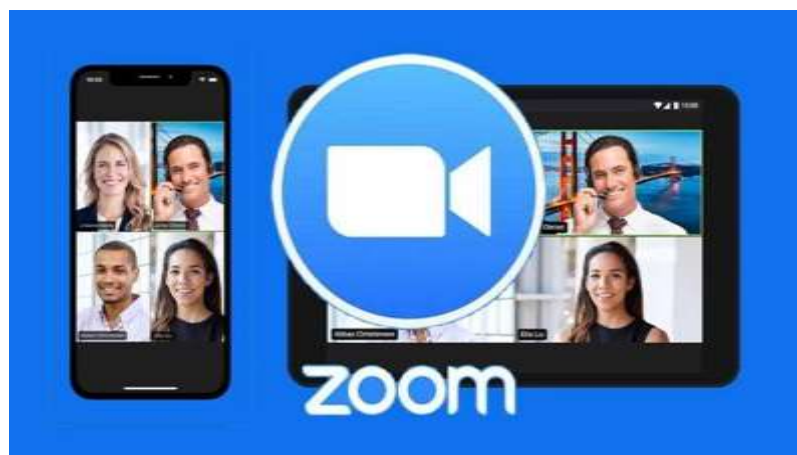
Figure 2. Online Learning Support Application, Zoom

In current online learning, the use of ICT (information and communication technology) tools is very much needed as a means of learning, but not only a tool that is needed, to maximize this online learning, Teachers and Students need a system to help effectiveness. Learning from a distance is to use the Zoom Meeting Application (Figure 2).