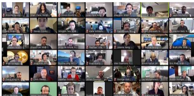
Figure 4. Large Space Using Zoom

Zoom provides solutions to userspace problems. The access to space capacity provided by this technology is quite large. Zoom provides 1,000 access for members in 1 discussion forum and 10,000 members in one live broadcast forum. It is quite easy for users, especially educators and students, to do online learning (Figure 4).