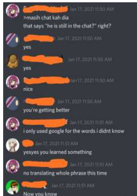
Figure 1. We and the other people on the server talk to a native people (Pink is the Brazilian)

Because we using a discord to talk with native speaker, the conversation skills will be tested here. Sometimes they might ask about any topic and need to reply it clearly. This can be done either using Chat or using a VC (Voice Call). In Figure 1 below, one of us try to talk with a Brazilian and in this conversation, the Brazilian is trying to learn Indonesian, so we and the other people on the server try to explain it clearly via chat. This also trains our English conversation skills.