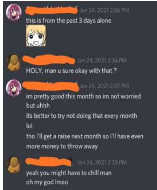
Figure 2. One of us talking with the native speaker directly (Pink is the native speaker and the yellow is one of us)

In Figure 2, one of us talking directly with the Brazilian, while using day to day English, because this test our conversation skill, so grammar doesn't really matter here as long as they can understand.