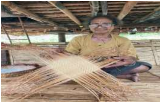
Figure 4. Manufacturing drawing basket