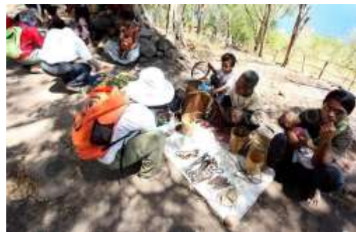
Figure 5. Activities Woman