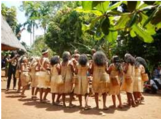
Figure 8. Lego-Lego Dance in Monbang Kopidil Village, 2025

The two pictures above are the Lego-Lego dance performed by women and men in a circle and holding hands while dancing and singing together, while the Cakalele dance is only performed by a group of men using arrows and swords which depicts the guarding of the Takpala traditional village. Lego-Lego dance and dance pick-up guests made by women in traditional villages Monbang is characteristics typical friendliness and respect woman to visitor or visitors who visit Mobang village, as in the picture following.