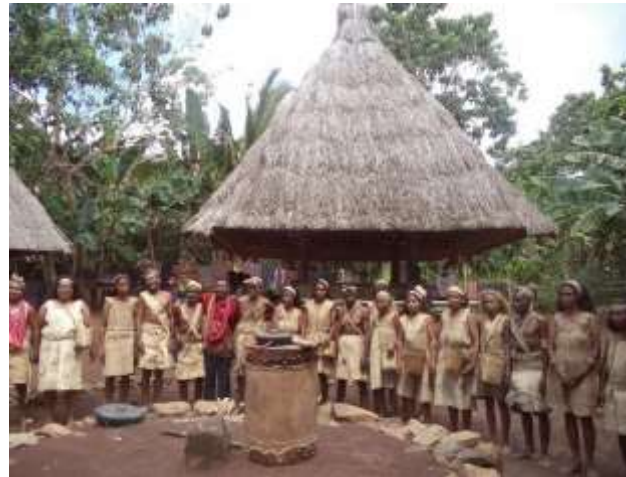
Figure 3. Traditional house of Monbang Traditional Village

is 1,215 Ha with a total population of 1,088 people. In Kopidil Village, in addition to the Monbang Traditional Village, there are also cultural tourist attractions that are the same as the Monbang Traditional Village, having almost the same form, be it the place, culture and traditional clothing made from tree bark. The following is a picture of the Monbang traditional village.