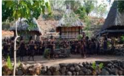
Figure 1. Location of Takpala Traditional Village

The picture above is the location of the Takpala Traditional Village and cultural ceremonial activities honoring the ancestors by singing while surrounding the altar (stones arranged on top of which are placed moko ) carried out by traditional elders, community leaders and women's groups, this is done to receive blessings before carrying out planting and harvesting activities in the fields.