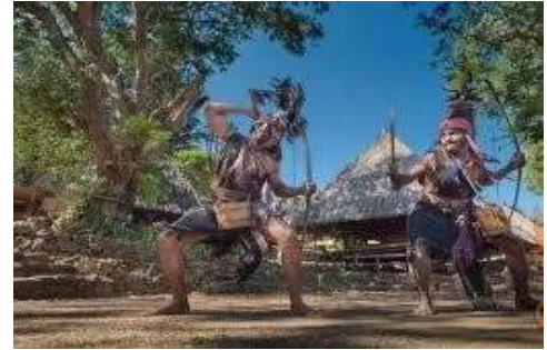
Figure 7 Cakalele Dance