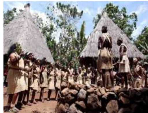
Figure 9. Guest Welcome Dance Data Source

The picture above is Lego-Lego dance and dance guest pick-up is done by men and women in form circle and hold hands hand while dancing and singing together. Meanwhile dance Guest pick-up is done at the time visiting tourists to destination tour culture in traditional Villages Monbang, then woman do dance pick-up visitor for the tourism. Government Alor Regency promotes tour culture in traditional villages Takpala and Monbang with organize Alor Expo for increase amount visit tourists in Alor regency, especially in traditional villages Takpala and Monbang .