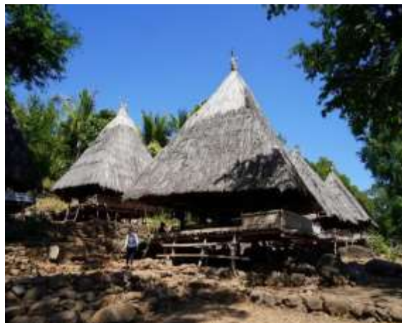
Figure 2. Takpala community warehouse

The image above depicts a traditional Takpala village dwelling, a three-story warehouse. The first serves as a cooking and living area, the second as a sleeping area, and the third as a storage area for food (corn, rice, cassava, and other crops) and a moko ( a small wooden house ) Monbang Traditional Village is an original village of the Kabola Tribe, which was created and formed in a special area in the middle of the Kopidil Village settlement. Kopidil has its own meaning, namely, Coffee Plantation. Geographically, Kopidil Village is located to the West of the District Capital which is an internal part of Alor Regency with 3 km from the district capital and 7 to 8 km from the district capital. The area of the village itself