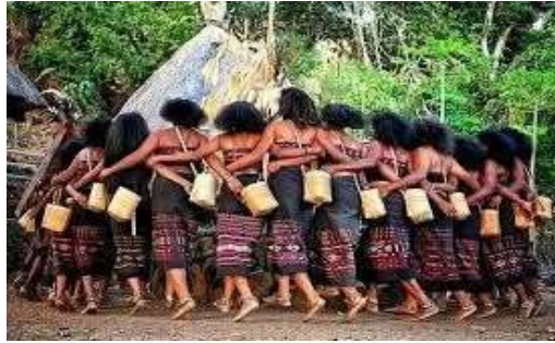
Figure 6. Lego-Lego Dance